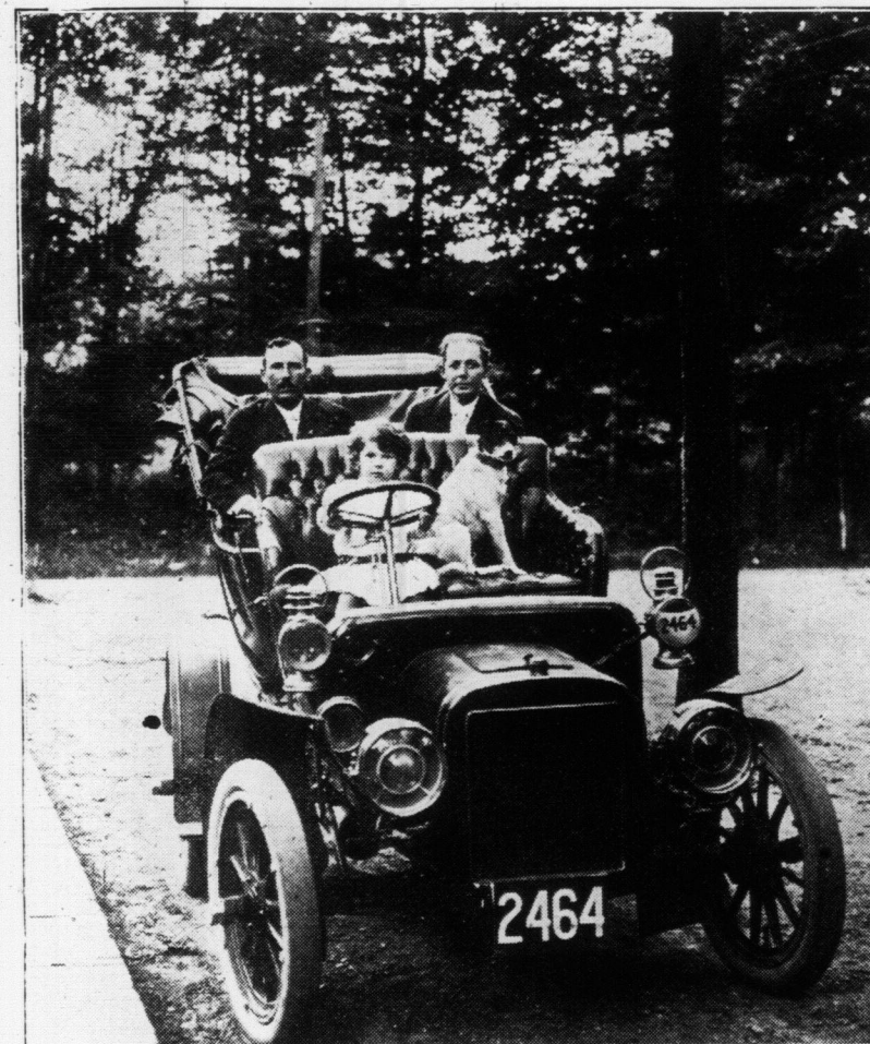
A YOUTHFUL CHAUFFEUR.

Uncle Reuben came back from the city, excited and nervous. He had gone to the city to transact some law business connected with his farm, with a lawyer whose office was in a modern skyscraper, and whose address Reuben carried along for memorandum. "Wal," he began, after his wife, alarmed at his changed condition, had threatened to summon the doctor from the nearest village, if he would not explain its cause, "I had about th' skinkest shave from death, this morning, I ever heard of! I wuz in that lawyer's buildin', too. Y see, I found th' right place an' started lookin' thru th' buildin' fr' his name an' number. Finally after walkin' up stairs after stairs fr' over two hours, I set