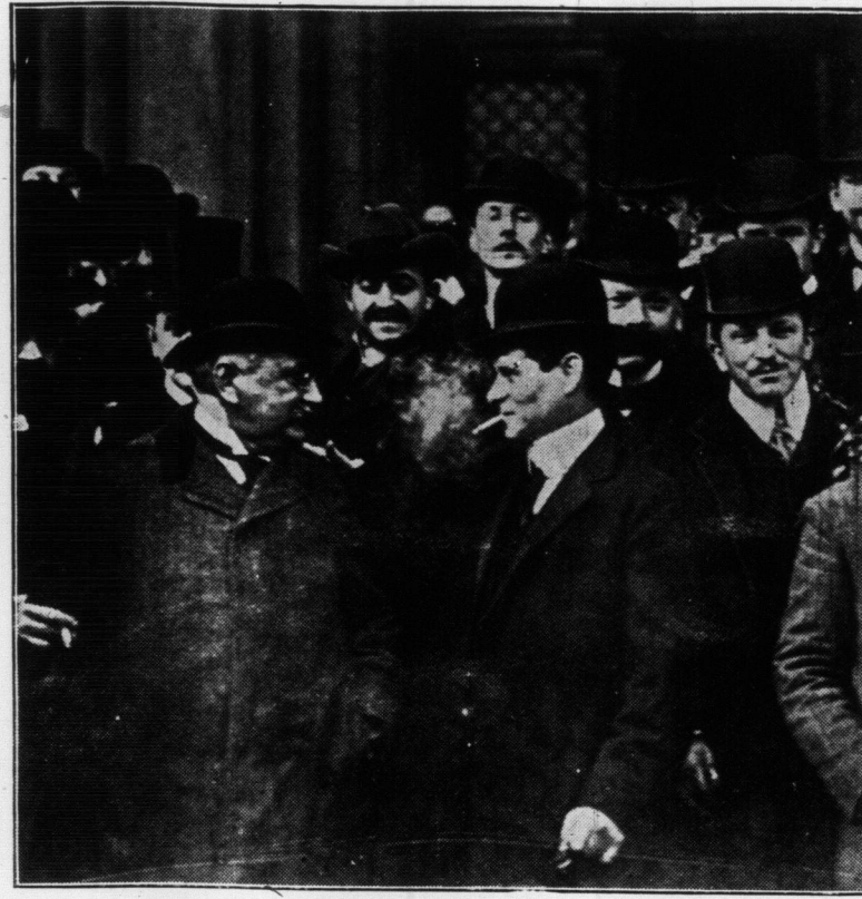
FIGURES IN BERLIN SCANDAL.