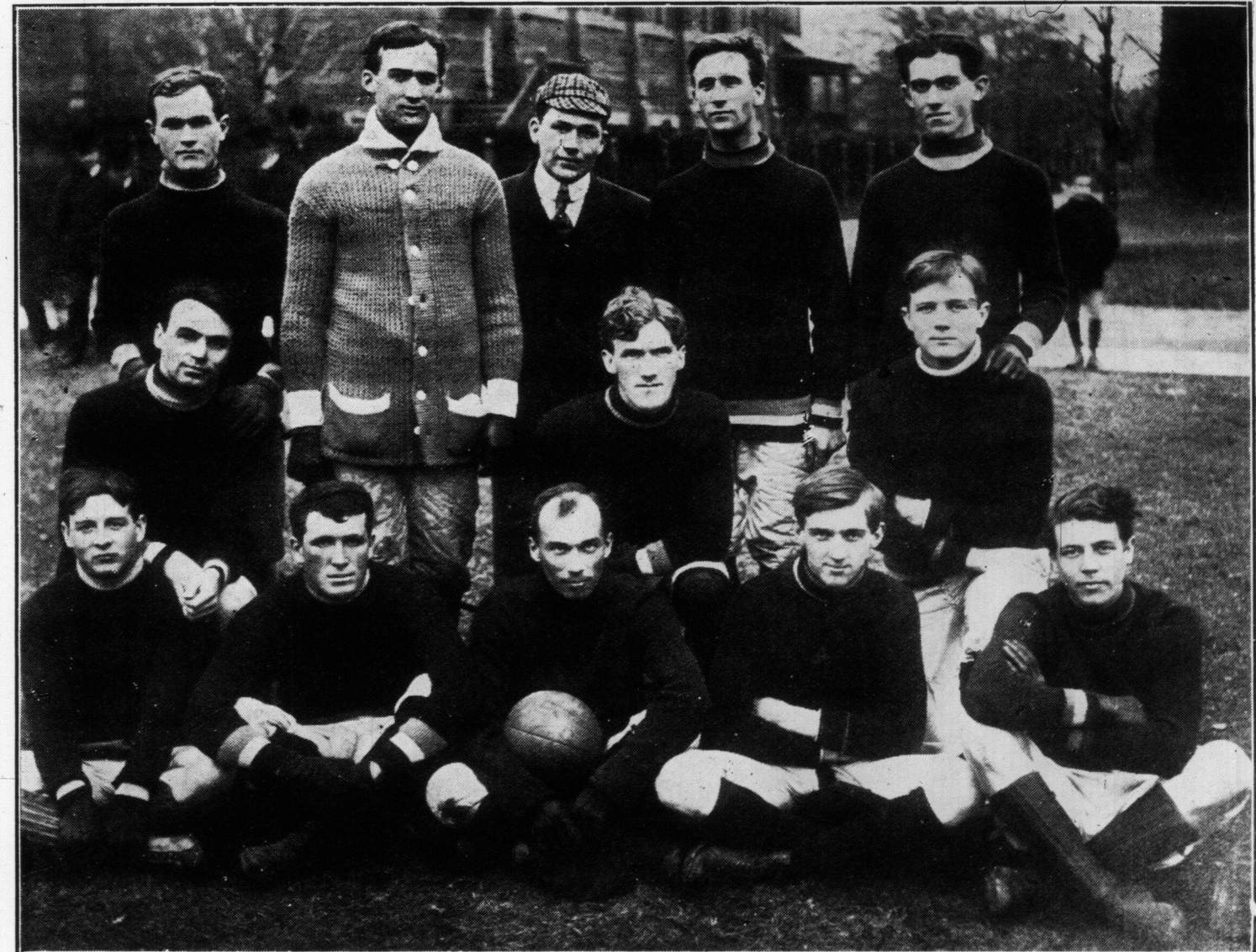
VICTORIA COLLEGE ASSOCIATION FOOTBALL TEAM.