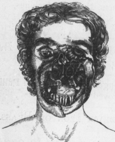
EFFECT OF DELAY.

Restoration to original color, by careful application, an established certainty.