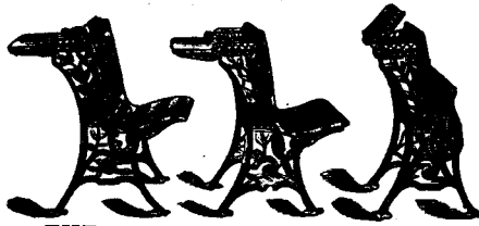
THE "MARVEL" SCHOOL DESK,