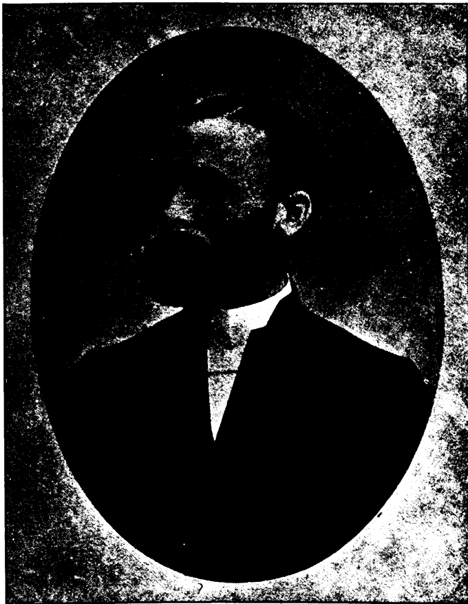
HON. J. H. LOUGHEED, Seconded of the Address in the Senate.