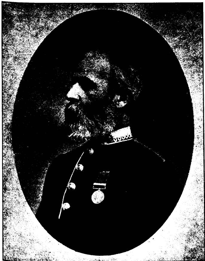
LIEUT.-COL. HON. C. A. BOULTON, Mover of the Address in the Senate.