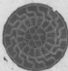
Locked Coil Aerial Cable or Colliery Guide.