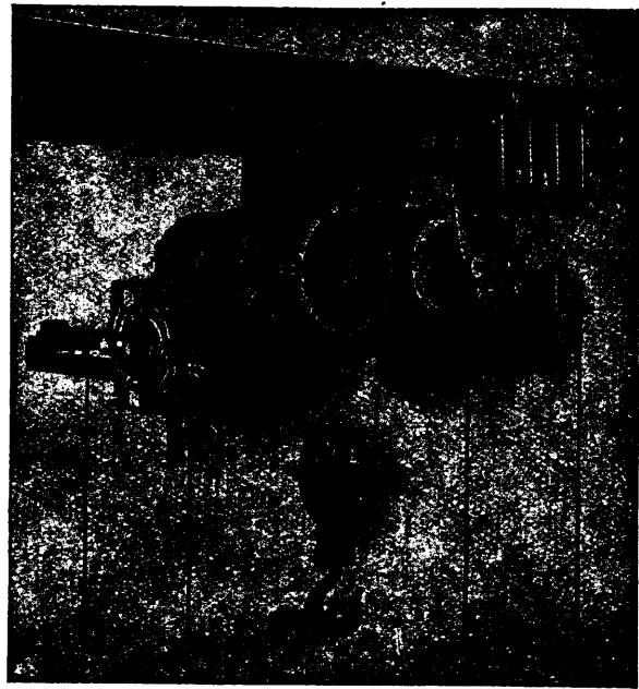
Westinghouse Induction Motor Driving 1,200 lbs. Capacity Single Rail Crane.