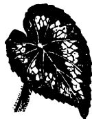
Leaf of Begonia Rex, showing the netted veins.