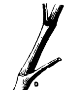
D, Node or Joint.