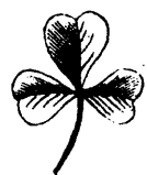
Obcordate Leaflets Oxalis Bowei.