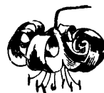
Revolute Segments of Perianth.