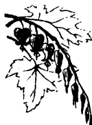
Raceme of Dicentra.