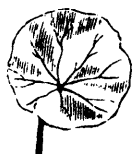
Orbicular Leaf of Tropaeolum.