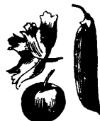
Pericarps: Hazelnut, Pea &amp; Cherry.