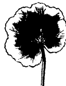
Pelargonium Leaf. O, Petiole.