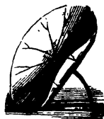
Peltate, or shield-shaped leaf.