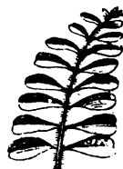
Pinnate Leaf of Ceanothus.