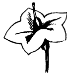
Rotate Flower. Potato Blossom.