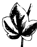
A Leaf with lobes.