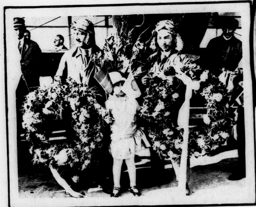
Japanese aviators greeted by little Japanese girls on their arrival in Berlin after their flight from Tokio