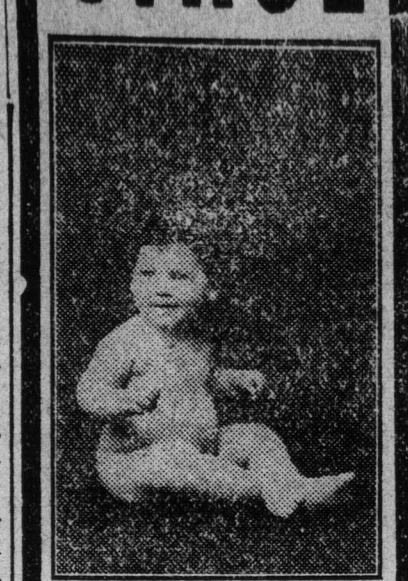
did not expect her to live

NOTICE THE VIROL SMILE! A Wonderful Food for Children of all ages.