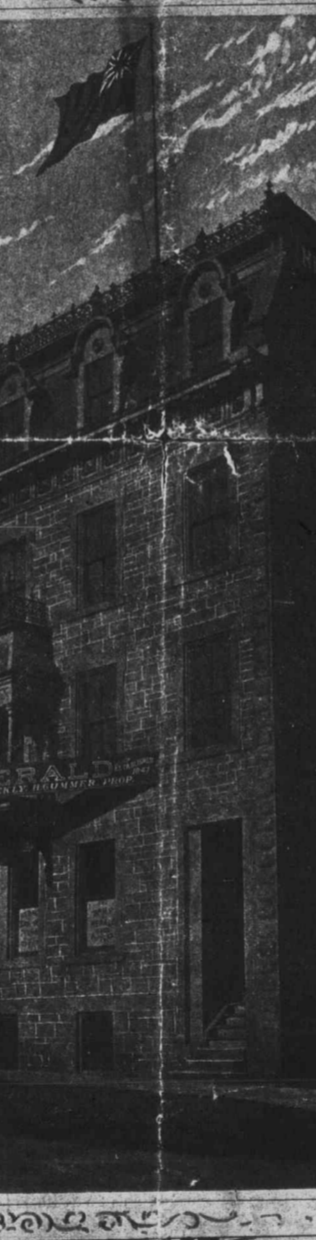
THE HOME OF THE HERALD.