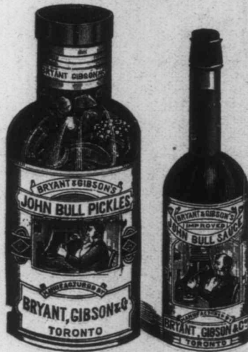
This is a facsimile of our bottles.

BRYANT, GIBSON & Co., TORONTO, Manufacturers of