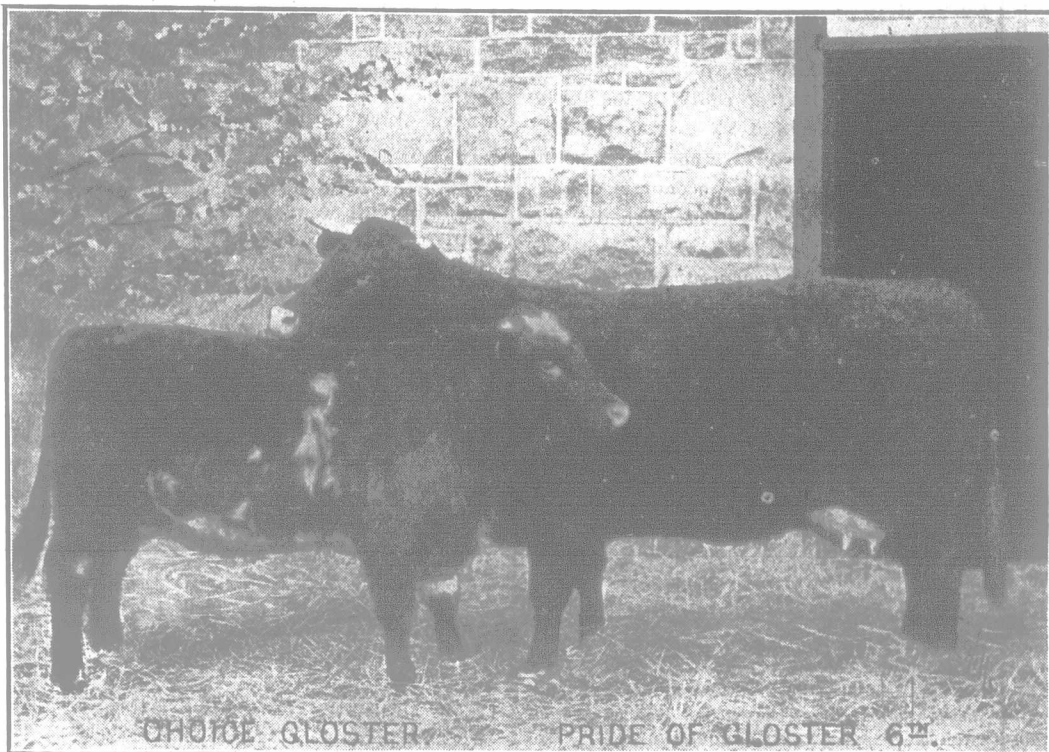
Choice Gloster and Pride of Gloster 6th. Will be included in sale.