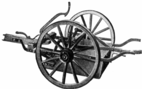
Western Wheel Scraper.

SPECIAL PRICE LIST AND LITERATURE ON APPLICATION