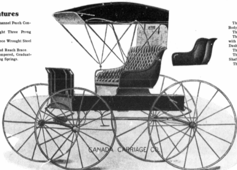
No. 552 "Brockville Auto Seat"