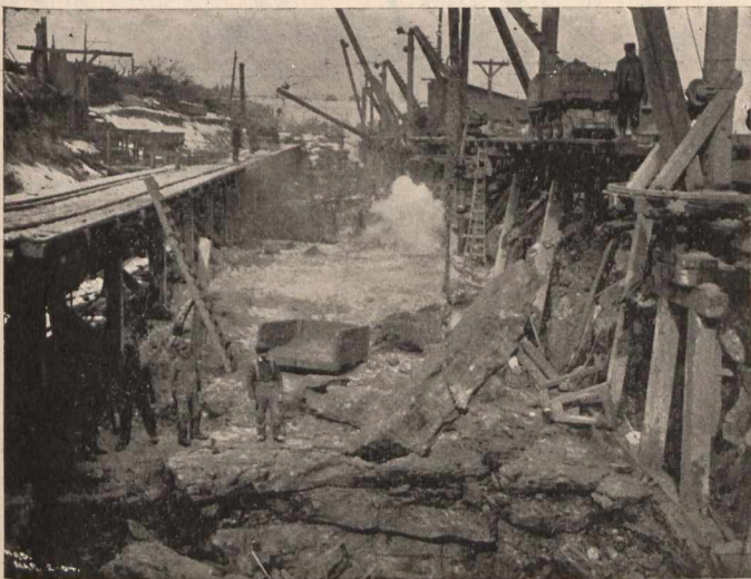
Toronto and Niagara Power Co.—Site of wheel pit in March, 1904.

The works of the Canadian Niagara Power Co. have already been described in the Canadian Engineer, this company having been the pioneer in the development on the