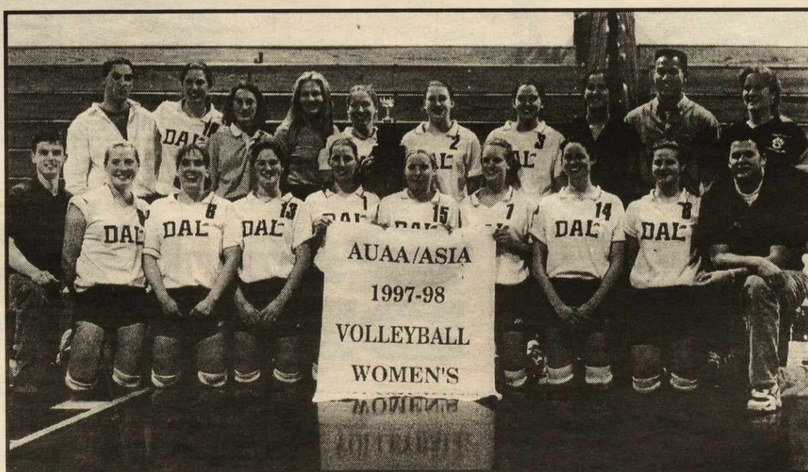
The Women's Volleyball Tigers captured the AUAA title on February 22 at the Dalplex. Please see next week's issue for the story in its entirety.