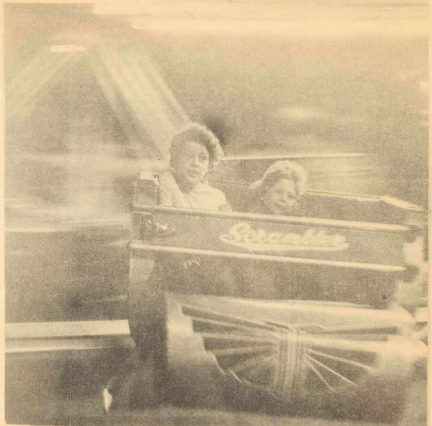
N.S. Student Aid takes students for a ride

Gazette planning action on Student Aid bureaucratic mess Information needed — Students who have had hassles, particularly with the higher Appeal Board, leave a note with name and phone number in the Gazette office.