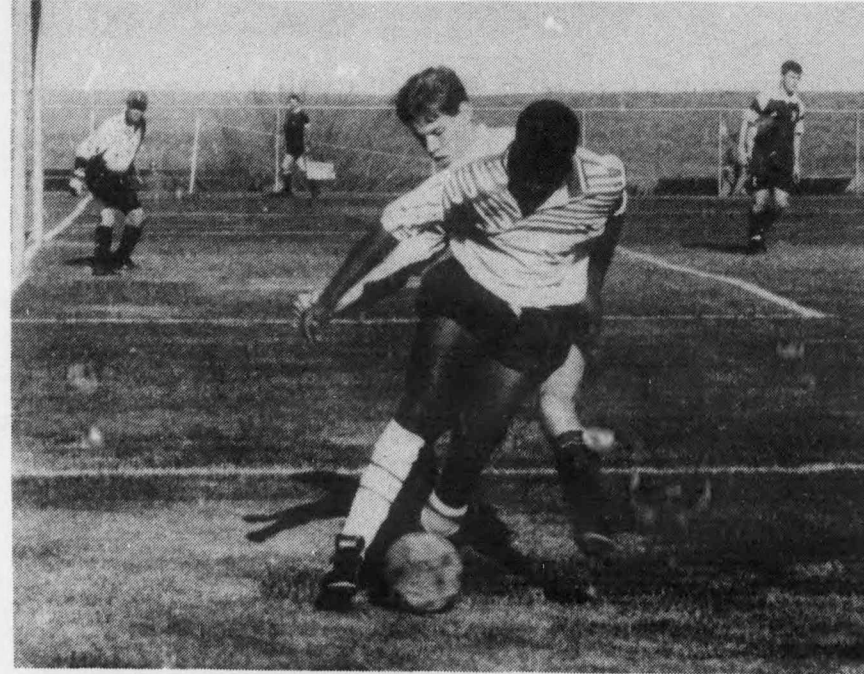
Action from the disputed MUN vs UNB game.

The Reds will take on the 2-6-1 UPEI Panthers on Saturday and Sunday will meet UdeM both on the road.