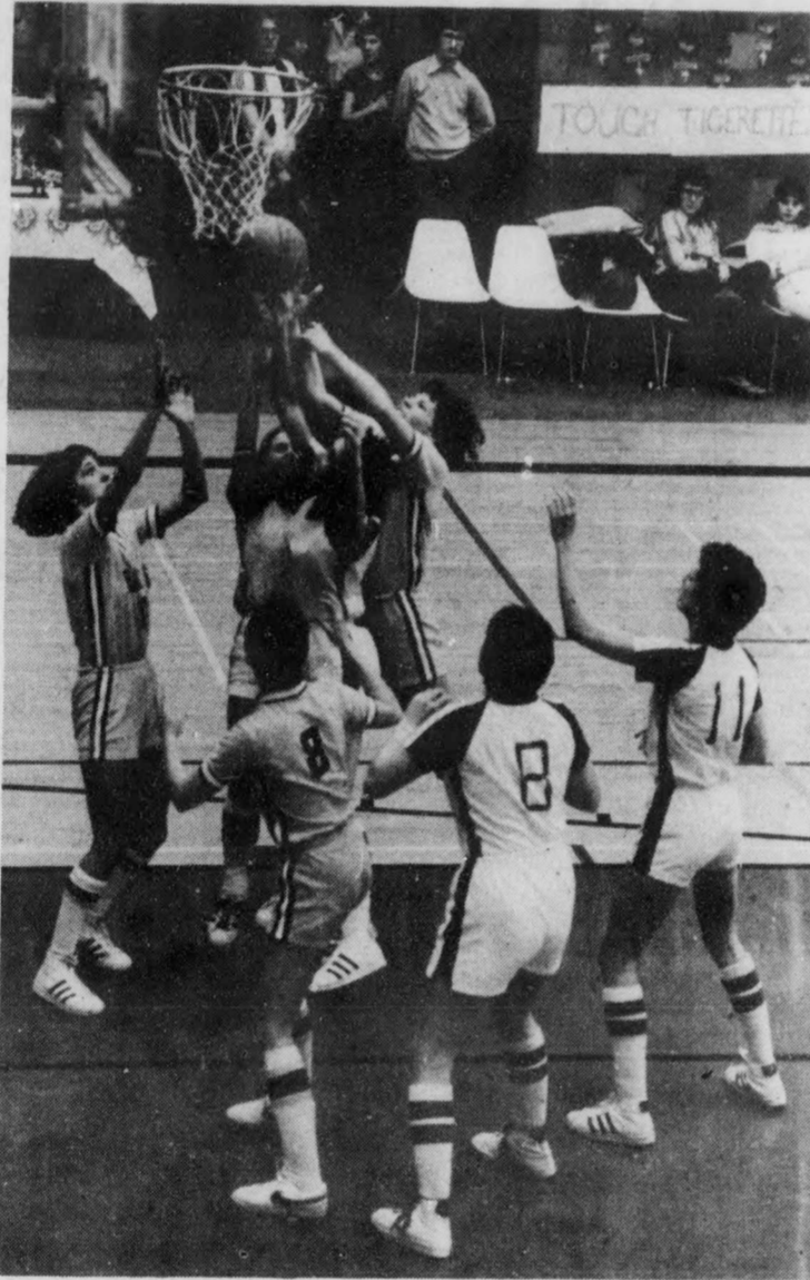
The Red Bloomers made it all the way to the nationals where they finished fourth.

At the conference playoffs, five of the Bloomers were chosen to either the first or second all star