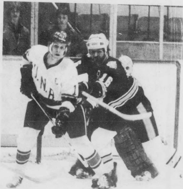
The Red Devils proved that they weren't that bad by beating the U de M Blue Eagles twice.