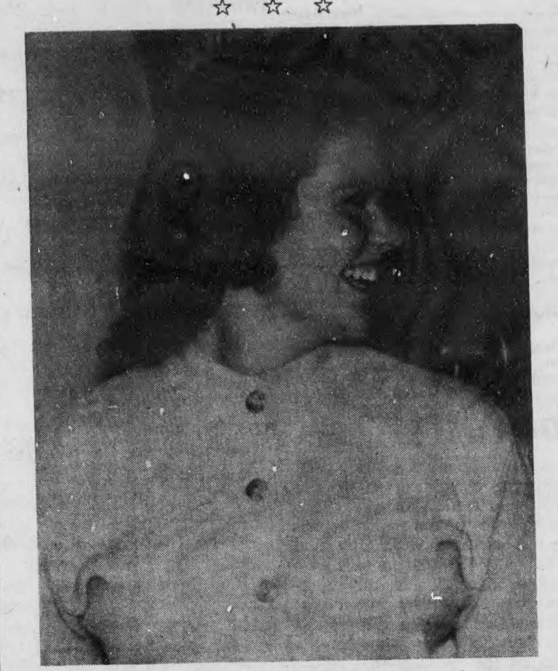
Her Majesty Miss Winter Carnival 1960

The conference concluded with increased Government aid for Sessions were interrupted Sat- students, and for a continuation