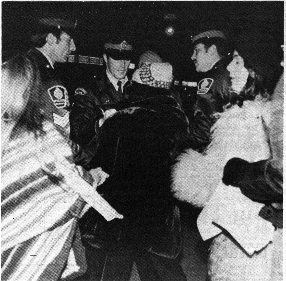
Police grab and question a woman at the "Women Reclaim the Night March" Saturday. About 100 women turned out to show their discontent with the way women are shafted by the law and our society.