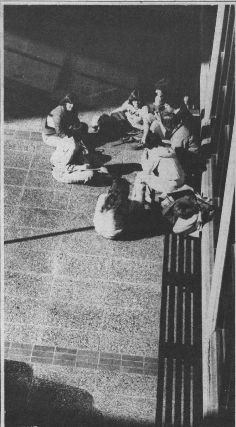
The Gateway's answer to Sunshine Girls... our photographer caught these women basking in the SUB courtyard yesterday afternoon. With temperatures hitting plus 10 degrees, can final exams be far behind?