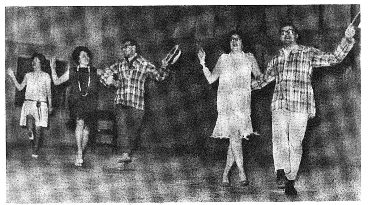
the faces of cast-members rehearsing for the Varsity Varieties production "Recapture the

The group visited a large number of Russian universities and other training institutes whose students were extremely interested in world affairs and the part that Canada is taking in them. One of the questions asked of the Canadians was; "what are you doing for peace?" It was an exceedingly difficult question to