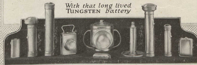
With that long lived TUNGSTEN battery

Canadian National Carbon Co., Limited Toronto - - Ontario