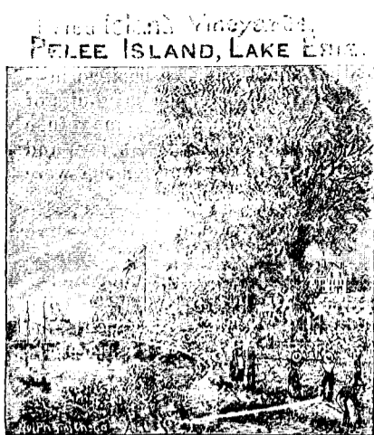
PELEE ISLAND, LAKE ERIE.

J.S. HAMILTON & Co. BRANTFORD. SOLE AGENTS FOR CANADA. Catawba and other brands in 5 gal. lots, $1.50; 10 gal. lots, $1.40; 20 gal. lots, $1.30. Bbls. of 40 gals., $1.25. Cases, 12 qts., $4.50; 24 pts., $5.50. For sale in Toronto by J. Herwick, corner King and York Streets. Fulton Michie & Co., 7 King Street West and McCormick Bros., 431 Yonge Street.