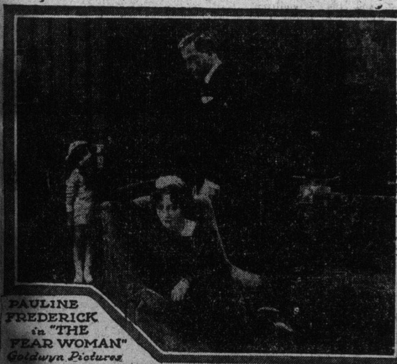
PAULINE FREDERICK in "THE FEAR WOMAN" Goldwyn Pictures