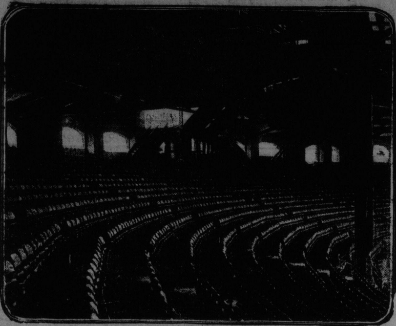
THERE ARE 12,000 SEATS LIKE THESE IN THE NEW GRAND STAND.