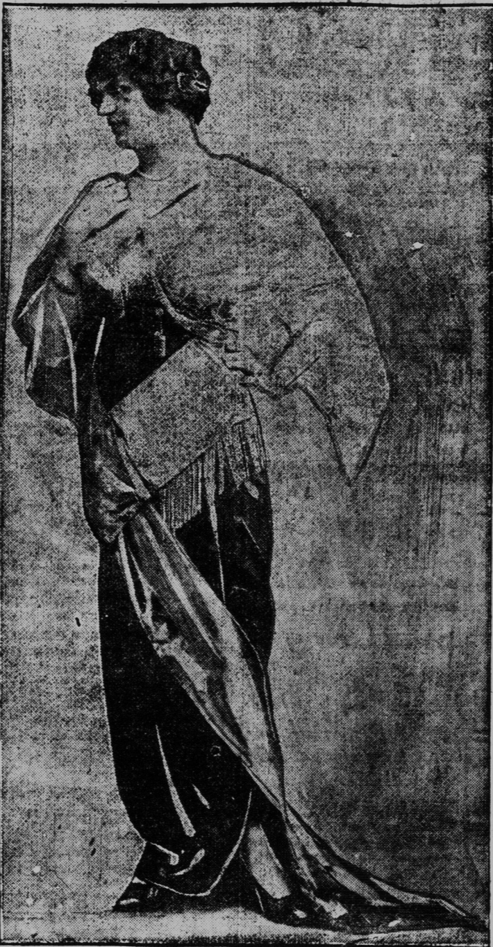
Skirts full and sashes re-fringed, one of the latest models in the drawing rooms of old London this season. The general abandoning of the corset by the leaders of fashion in London and Paris has naturally led to a fuller treatment about the hips. The pretty lace effect around the shoulders is always a feature.