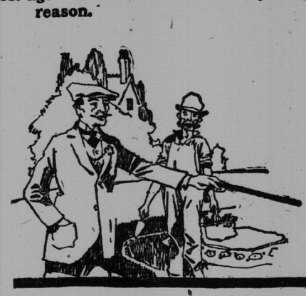
At age 60 he has no anxiety for the future, and leisure for his many interests.