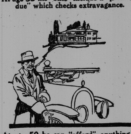
At age 50 he can "afford" anything in