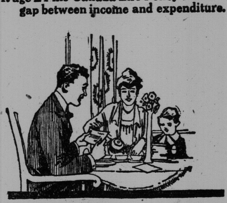
At age 35 his "bills" include a "premium due" which checks extravagance.