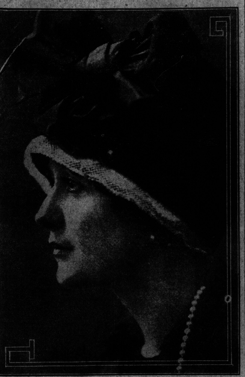
"Beauty lives with kindness": Mme. Lina Cavallieri, who is tending wounded in Paris.