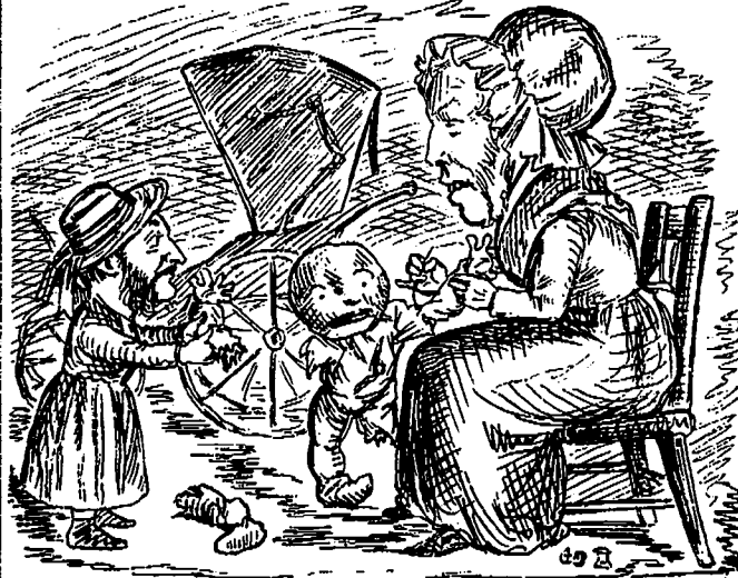
AFTER WEST TORONTO!

Mrs. Wallace.—Catch me entrusting this precious child to your care again!!