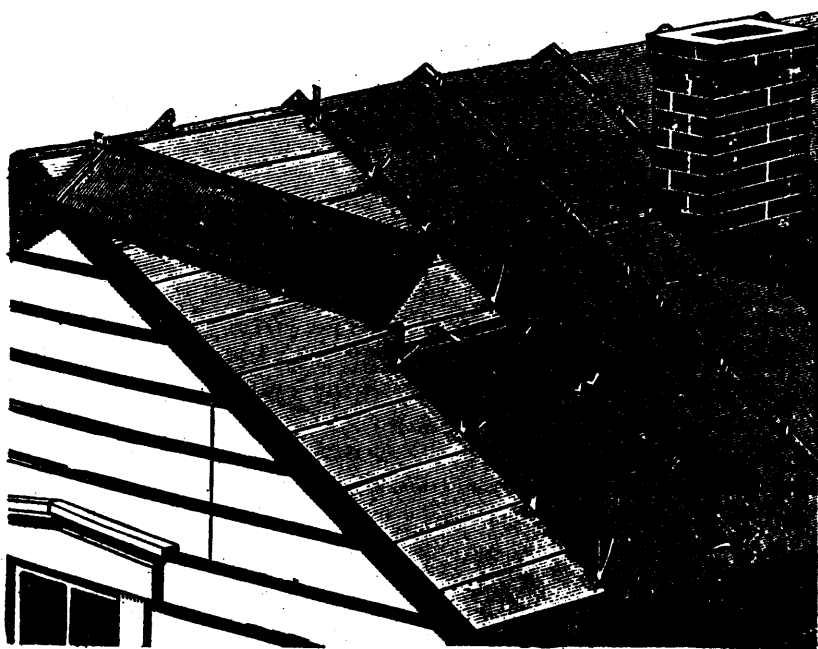
IMPROVEMENT IN METAL ROOFS.