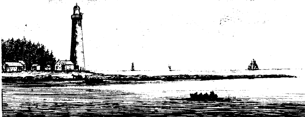
LIGHT-HOUSE, WEST POINT, ANTICOSTI.