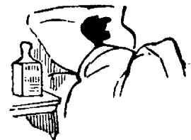
MORAL—ETERNAL VIGILANCE AND LABOR IS THE PRICE OF CHOLERA MORBUS.