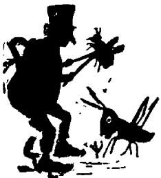
THEN BEGINS THE CRUSADE AGAINST BUGS, WORMS, GRASSHOPPERS, ETC.