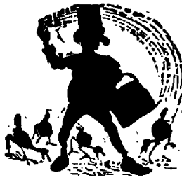
BOWS A CHOICE VARIETY OF SEEDS.