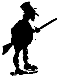
HE PUTS MORE FAITH IN WATCHING IT HIMSELF.