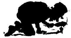
THE CROP BEGINS TO SPROUT. HE MAKES AN INSPECTION.