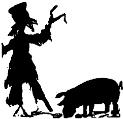
HE SETS UP A SCARE-CROW. HE IS ALL RIGHT AS FAR AS CROWS ARE CONCERNED.