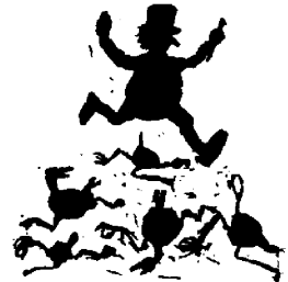
BUT IS TROUBLED A GOOD DEAL WITH FOULTRY.