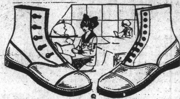
Children's White Canvas Skuffer Laced Boots, only $1.50 per pair