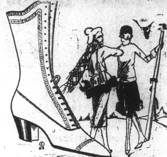
Ladies' Two Tone Canvas Boots, Cuban Heel, only $2.00 per pair

LADIES' LACED and STRAP SHOES in Black and Tan leathers; Low, Military, Cuban and Louis Heels.