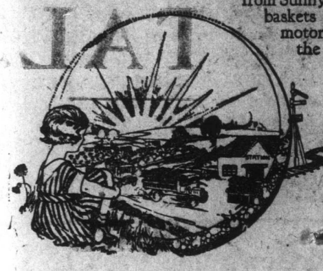
Little Miss Sunrise watches the fruit arriving.

WHEN all the ripe and perfect fruit—Strawberries from Kent and Hampshire, Plums and Black Currants from Worcester, Apples from Devon, Oranges from Sunny Spain—are packed carefully into baskets and cases, they come by direct motors, special trains and steamers, to the model factory.