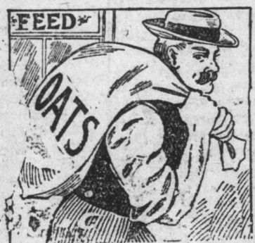
To-day ex. "DIGBY" from Halifax: