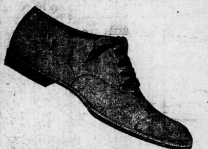
Women's White Duck Shoes,