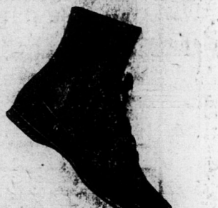
Child's Red, Tan and Black Slippers and Boots,