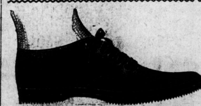
Boys' Canvas Shoes.

All Rubber Soles and Heels. Black and Brown.