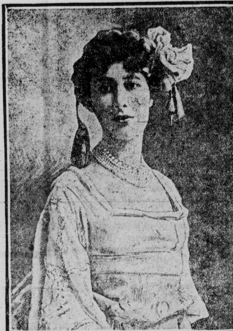
Mlle. Liane de Pougy.

Mademoiselle de Pougy cut off her hair because it