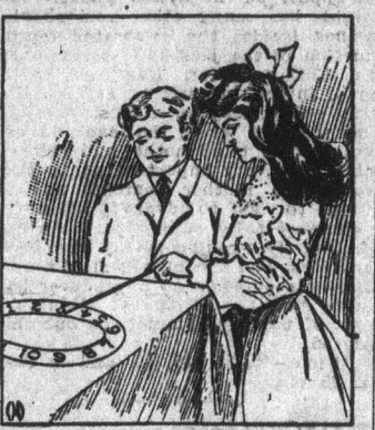
THE MAGIC DIAL.

Ask any of your playmates to think of some hour of the day. Tell him to deduct it from 20 and remember the remainder. You produce your big clock dial and inform him that you are going to count around on the dial and that when you have counted the number corresponding with the remainder that he must remember, he must stop you. Suppose he thought of 5 o'clock. Five taken from 20 leaves 15 remainder. You now count promiscuously (mentally, not orally), pointing at each count with a pencil to one of the hours on the dial (which must be provided in advance and is made by cutting out a circle of cardboard and marking on it with ink the twelve figures of the clock face). Be sure when you make the eighth count to point to the "12" and thence in regular rotation backward toward the left. When you come to the figure "5" you will be stopped, as this will be the fifteenth count, corresponding to