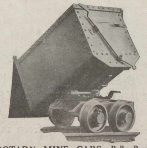
ROTARY MINE CARS: Roller Bearing Will dump at either side or end Made in a large range of sizes and capacities We also make any other style of small car required by the customer