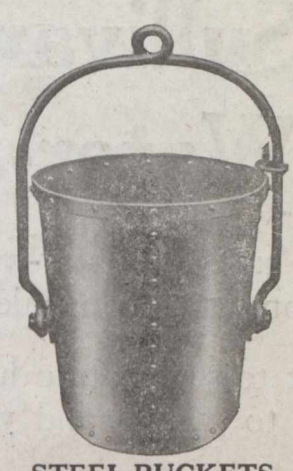
STEEL BUCKETS made any design, and any size or capacity, to suit your needs

Safety BUCKETS & SKIPS also made to order