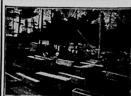
Packing Trees at Pelham's Nursery for Western Trade.

Write for new catalog describing the Union Line of Field, Hog, Poultry and Lawn Fences. Union Fence Co. De Kalb, Ill. Kansas City, Mo.