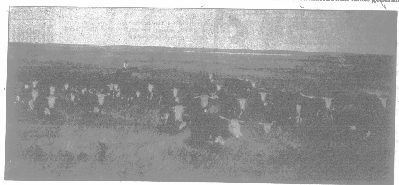
Hereford Cattle, Crane Lake, Assinibola, Main Line Canadian Pacific Railway.

The Canadian Pacific Railway Company have 12,000,000 acres of choice farming lands for sale in Western Canada. Eastern Assiniboia lands generally from $4 to $10 per acre, according to quality and location. South-western Assiniboia and Southern Alberta lands, $3.50 to $8 per acre. Ranching lands generally $3.50 to $4 per acre. Northern Alberta and Saskatchewan lands generally $6 to $8 per acre.