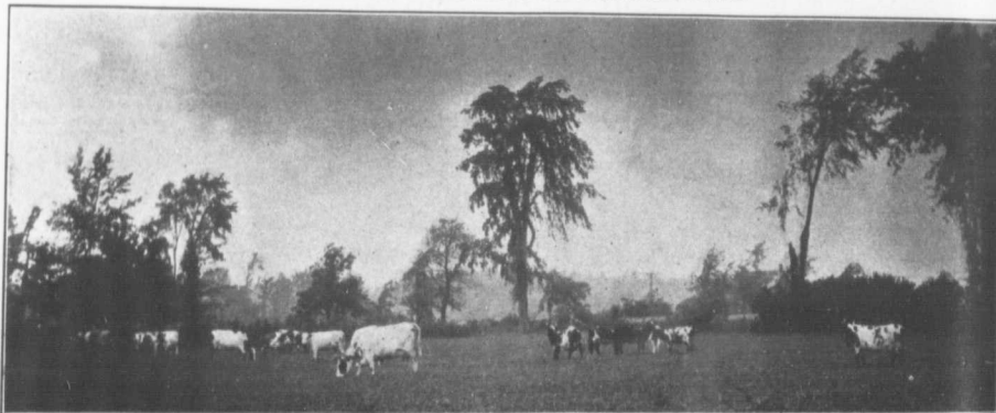
Glenhurst Ayrshires at home—a summer scene in Glengarry County. The cow in the foreground is Torrs Cony 3rd (Imp.) who has given 66 lbs. per day testing 4.2% fat. This is one of the grandest dairy cows in Canada, irrespective of breed. There are others in the Glenhurst herd that are almost her equal.

Ship Summerstown Station, G.T.R. Bell Telephone 78-3, Cornwall