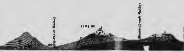
Section along line N-N