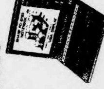
Weights only 4.3 lbs!!