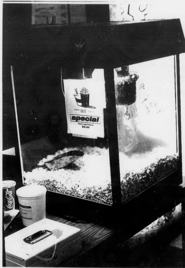
Popcorn... so simple, yet so controversial.