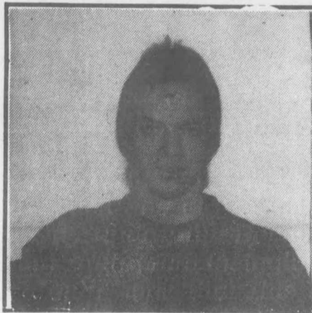
Cajun BA III "Two smashed up cars and a Jap radio."