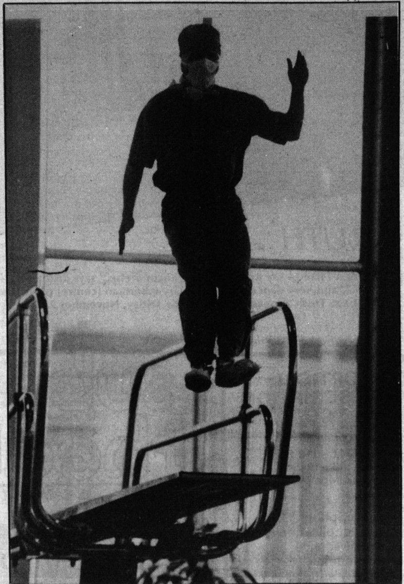
Diving for doctors from last year's Rec Men's Diving Meet.