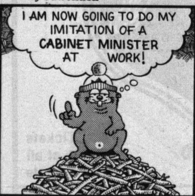
© Ian Ferguson 1983. All rights reserved.