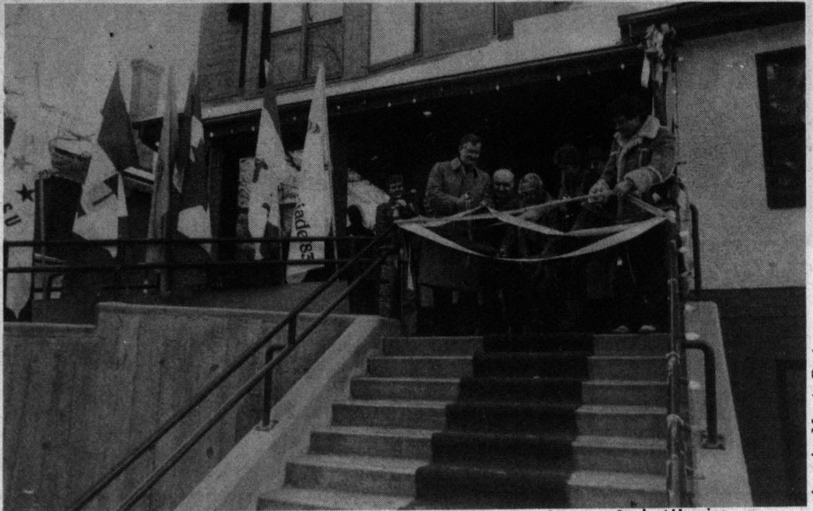
The ceremonial cutting of the ceremonial ribbon at the ceremonial opening of Garneau Student Housing.

Friday, January 7 Room 142 SUB 4:00 PM Refreshments Served