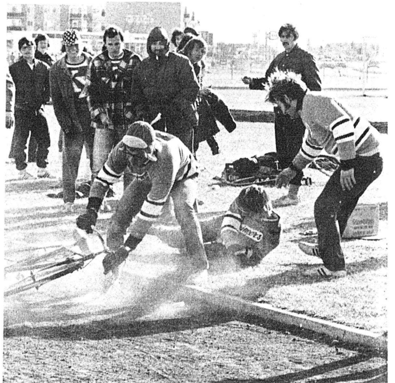
A SLIGHT MALFUNCTION ...at the junction

And it's the first home game in weeks, so come on out in droves or hordes or Volkswagens to watch the future Canadian champions in action. Game time is 2 p.m. at Varsity Stadium.